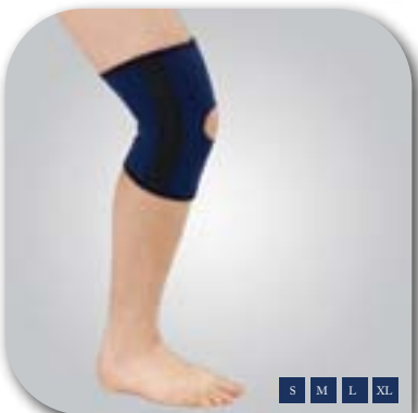
S M L XL