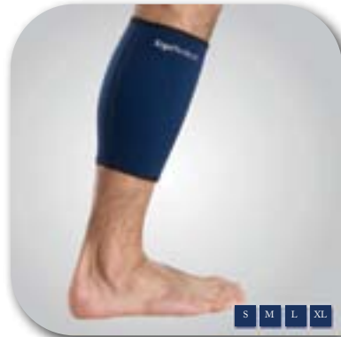
S M L XL