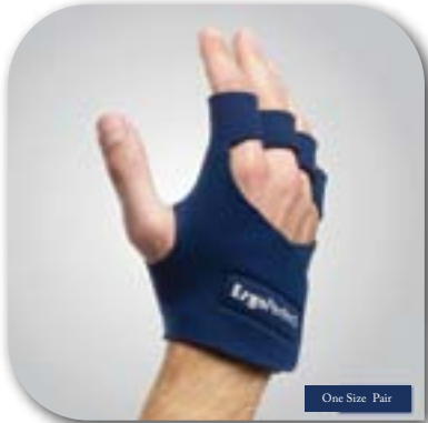
One Size Pair