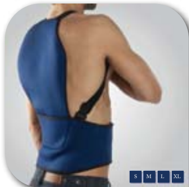
S M L XL