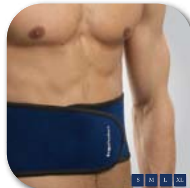
S M L XL